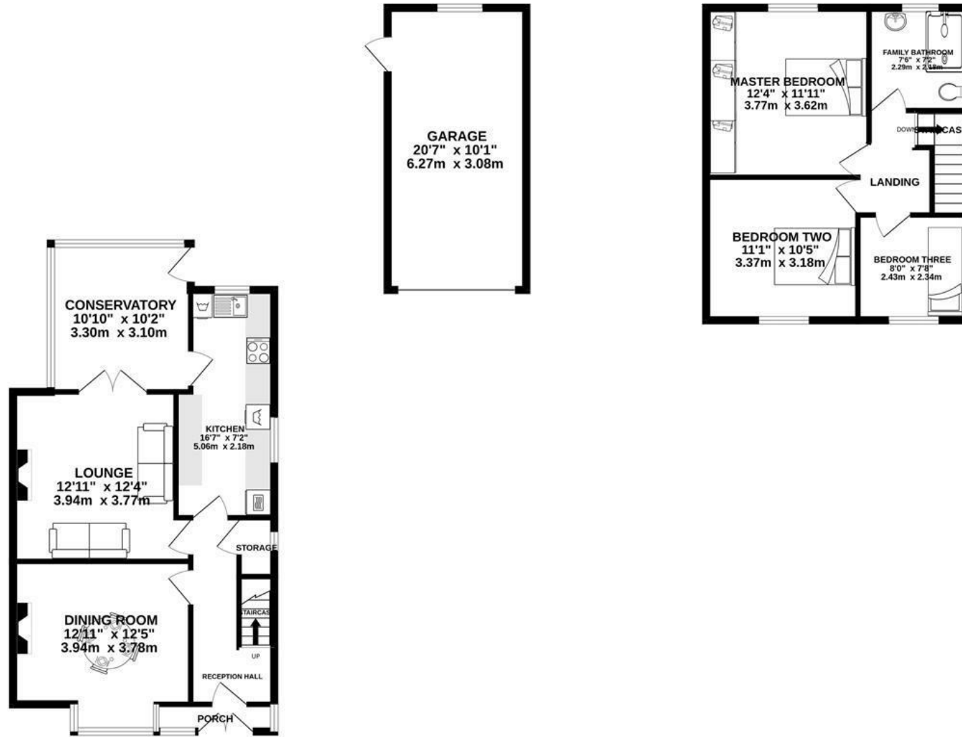
TOTAL FLOOR AREA: 1252 sq.ft. (116.3 sq.m.) approx.

Whilst every attempt has been made to ensure the accuracy of the floorplan contained here, measurements of doors, windows, rooms and any other items are approximate and no responsibility is taken for any error, omission or mis-statement. This plan is for illustrative purposes only and should be used as such by any prospective purchaser. The services, systems and appliances shown have not been tested and no guarantee as to their operability or efficiency can be given. Made with Metropix ©2026